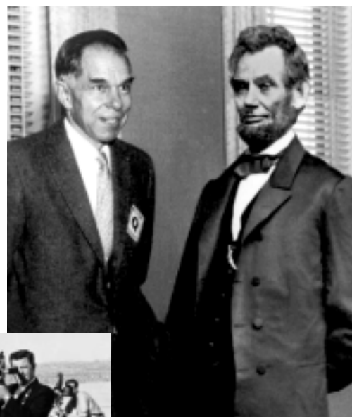
(Top) To Glenn from his staff on his 81st anniversary.

He was also tireless in informing the public about the benefits of nuclear energy and the use of radionuclides in industry, medicine, and the physical, chemical, and