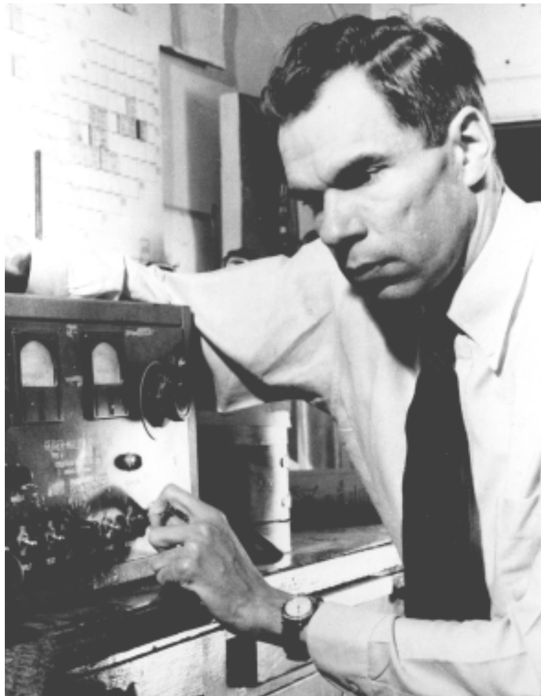
Seaborg is at a Geiger-Müller counter and amplifier at Berkeley in 1941. A chart of isotopes with replaceable colored entry cards is on the wall in the background.

In his lectures, Seaborg often noted that throughout 1941, the year that marked the beginning of the U.S. involvement in World War II, element 94 was referred to by the code name of “copper.” This name was satisfactory until it was necessary to use the real element copper in some of the experiments. The scientists circumvented the problem of distinguishing between the two elements by referring to element 94 as “copper” and to real copper as “honest-to-God copper!” The naming of element 94 followed the tradition of naming transuranium elements after consecutive planets in the solar system. Element 93 was dubbed neptunium (Np) after the planet Neptune, and element 94 was named plutonium (Pu). Seaborg and coworkers considered the name “plutium” but it “[d]idn’t roll off of the tongue like the name plutonium,” said Seaborg in one of his lectures. The obvious choice for the symbol would have been Pl, but facetiously, Seaborg suggested Pu, like the words a child would exclaim, “Pee-yoo!” when smelling something bad. Seaborg thought that he would receive a great deal of flak over that suggestion, but the naming committee accepted the symbol without a word.