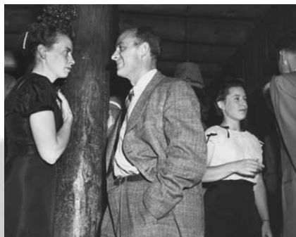
Fermi socializes with coworkers and friends at a party.

tum theory of radiation, he understood it so well that its extension to his theory of beta decay just sprung unbidden into his brain. Both an experimentalist and a theorist, he had the feel of physics in his hands. He