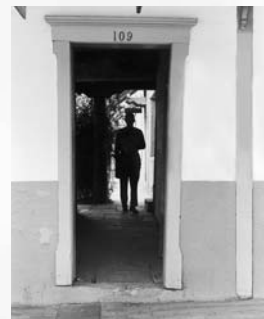
At 109 Palace Avenue in Santa Fe, they signed in.