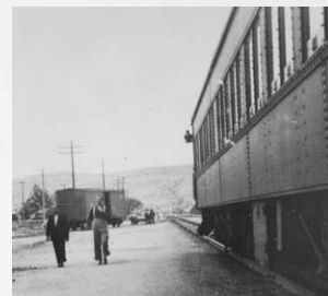
Newly hired Los Alamos staff arrived at Lamy, New Mexico.

"Hill fever," a condition usually not part of the medical lexicon and one not always appreciated by a husband mired in a resistant technical analysis. People were sometimes under stress, and release by drinking was a common indulgence. Although alcohol was off-limits on a military base, that was no barrier to the ingenuity of the