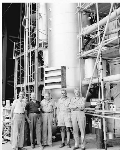
The Mike device is pictured just before it demonstrates the new thermonuclear concept.

At 7:00 a.m. on November 1, 1952, Mike exploded with a 10-megaton yield. The island of Elugelab vanished. A crater 1 kilometer in radius and 50 meters deep had been blown in the coral rock; a fraction of the missing material had been vaporized or shattered into dust, which was carried up in the mushroom cloud to pierce the tropopause, high though it is in the tropics. At about 15 kilometers altitude, the cloud entering the stable stratosphere was forced to spread out, forming a flat pancake, instead of the rounded top of the mushrooms from the smaller explosions of fission bombs. The stratospheric circulation would carry the radioactive cloud around the entire Northern Hemisphere. Once again, as it had done at Trinity with the fission bomb, the Lab succeeded spectacularly with the hydrogen bomb. The Mike shot of Operation Ivy went off only one year