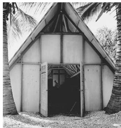
This chapel was built for the people involved in the tests on Parry Island (now known as Medren Island) in the Enewetak Atoll.

When the tide is out, the coral rock of the tidal plain is exposed. It has sharp ridges; the general surface is slippery with sea slime. A cut from the coral quickly becomes infected.