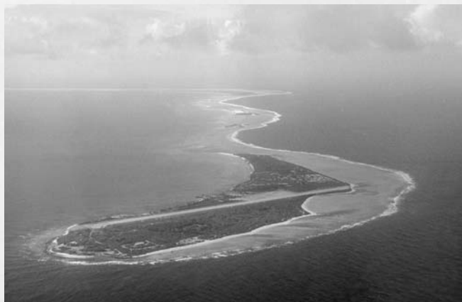
View of the Enyu Island in the Bikini Atoll.

Nuclear testing became a political, as well as a scientific, enterprise.