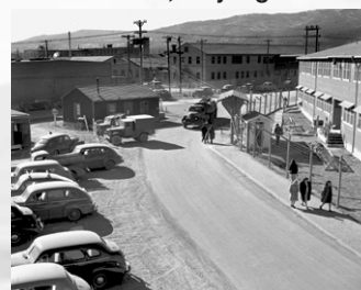
Once at the tech area in Los Alamos, they spent long hours applying the new concepts of nuclear physics to a usable weapon.