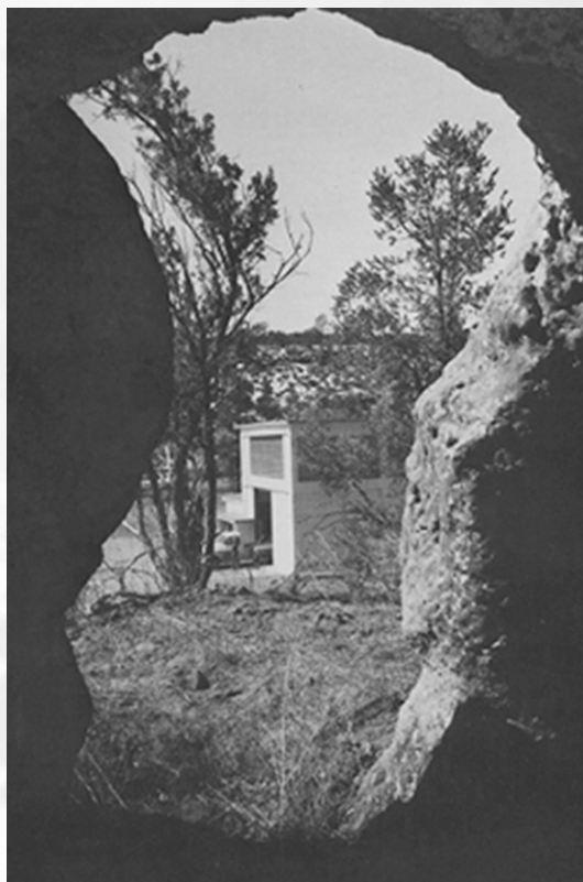
The building in which criticality experiments were carried out was called the kiva, a term borrowed from the Pueblo Indians. Here, the kiva is photographed from an Indian cave in the nearby wall of the Pajarito Canyon.

But the scientists were on familiar ground. In their research, as usual, nature was in charge, but not always