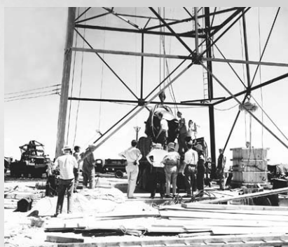
The implosion "gadget" is hoisted to the top of the shot tower at Trinity site.

The Trinity shot was the beginning of the nuclear testing procedure as a central feature of nuclear weapon development. Contrary to later test operations, however, Trinity was