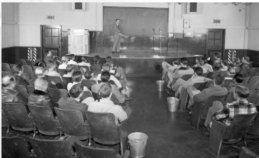
At the Laboratory, the hours were long, and the work hard. The weekly colloquia, one of which is shown in this photo, were stimulating and intense. They are still remembered.

European masters, who here were not Professor Fermi, Dr. Teller—just Enrico and Edward.