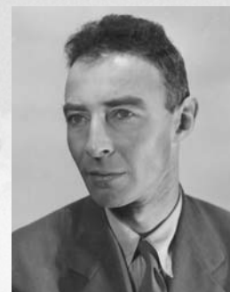
J. Robert Oppenheimer

By 1941, Fermi was already building a nuclear reactor pile in the basement of Pupin, the physics building at Columbia University. That pile could not achieve criticality because of the neutron-absorbing impurities in the graphite blocks then available. Fermi was the most complete physicist of the brothers, perhaps the most complete physicist of the century. He had