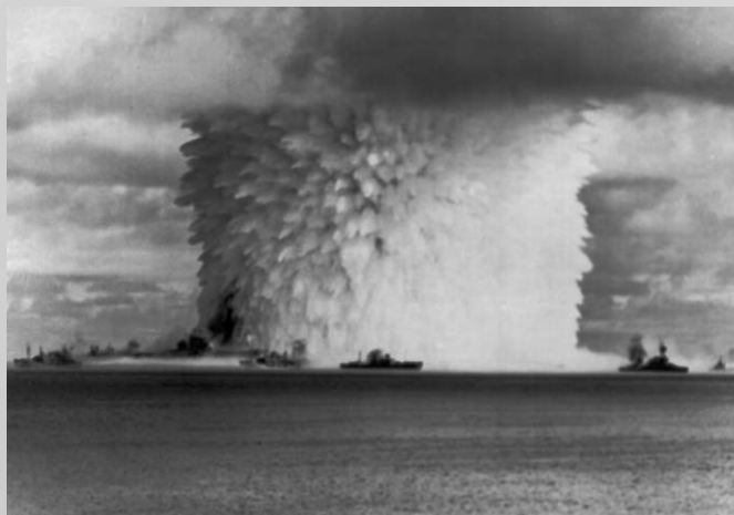
In 1946, two implosion bombs, identical to the one tested at Trinity site and the one that had destroyed Nagasaki, were tested as part of Operation Crossroads in the Pacific.

commonweal as a whole was well served by the dispersion of Laboratory personnel. With this acceptance in the larger world, the Laboratory itself was not to be abandoned. Some of the departees periodically returned to the Lab. It was possible for a staff member at home in Los Alamos in one afternoon to consult with all three visiting luminaries, Bethe, Teller, and Fermi.