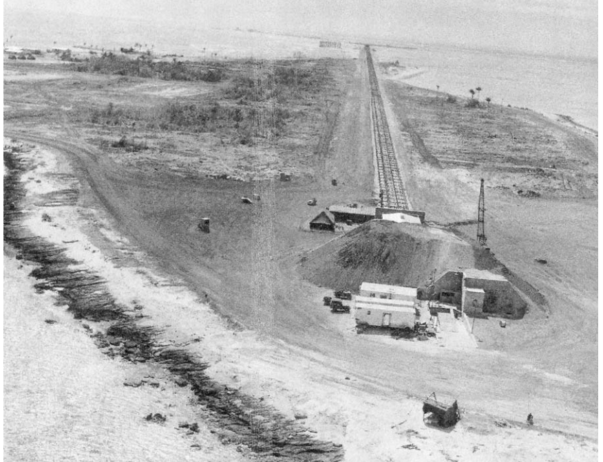
Figure 1. Line of Sight (LOS) from the Blockhouse to the Bravo Test Site

To understand what can be learned from diagnostics, one needs to know how a device operates. A modern thermonuclear weapon consists of four elements: a primary, a secondary, a separating volume, and an enclosing radiation case. Nuclear device operation begins with the initiation of the detonators for the high explosive