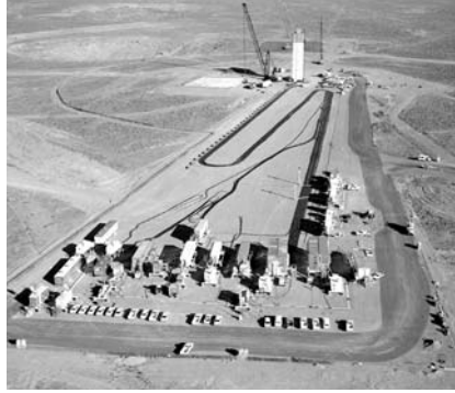
Figure 4. Tower and Cables before Lowering the Rack

Staff of the design and engineering divisions would get together to determine what the nuclear device would be and the features or properties that would be needed to address the goals for the test. Then staff from the design and physics divisions would determine the best diagnostic experiments required to obtain the necessary data