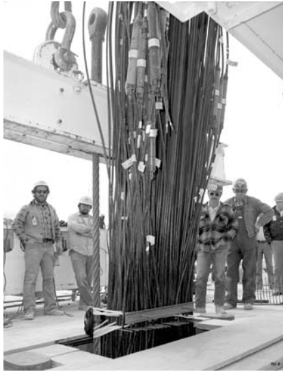
Figure 5. Lowering the Rack

The analysis of the numerous measurements collected results in a deep understanding of how the device operated. Typical questions that test diagnostics answer and that can later be compared with simulation results are the following: Did the multiple detonation points of the HE initiate a correct detonation wave? Is the arrival time of the first neutrons or the time from HE initiation to the