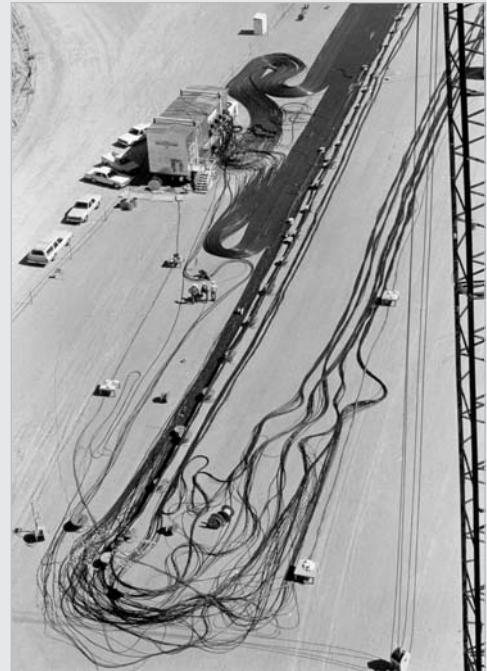
View of the coax cables looking down from the rack tower.

Let’s first estimate the distance D at which the radiation from a typical aboveground fission explosion with a 15-kiloton yield would induce a spurious signal level of 1 ampere in a coax cable 1 centimeter in length whose radius is also 1 centimeter. To estimate the flux, or number of particles per second, emitted from that canonical source, let’s assume that one gamma survives from each fission and that the fission rate is one mole per shake ( 10^{-8} second), or a 4-kiloton equivalent yield of gammas every 10^{-8} second. That gamma flux is Avogadro’s number ( 6 \times 10^{23} ) in 10^{-8} second, or 6 \times 10^{31} gammas per second, or about 10^{13} amperes equivalent flux of charged particles (1 ampere = 6 \times 10^{18} electrons per second). Distance, attenuation, and efficiency for converting gamma rays to a Compton current must all contribute to reducing this flux by a factor of 10^{13} . When these factors are used judiciously, the distances required become kilometers for aboveground testing and meters for underground testing, in which high-density stemming materials are used. However, for safety and signal-to-noise margin, underground dimensions are up to tens of meters (see Figures 1 and 4 in the text).