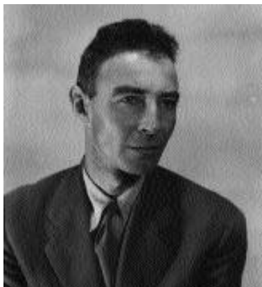
J. Robert Oppenheimer, 1943–1945