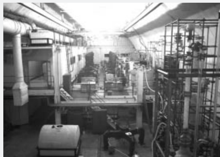
The tops of eight greenish tanks poke through the elevated floor of the Baksan Neutrino Observatory. The squat tanks contain a total of 57 tons of trapure gallium. Heating the tanks to about 30 degrees centigrade keeps the gallium in liquid form. Once or twice a day, one of the hundred trillion or so solar neutrinos that pass through the tanks each second interacts with the gallium and produces an unstable germanium atom. These unstable atoms are extracted from the tanks once a month. The red motors seen perched above each tank are used to rapidly stir the liquid gallium during the extraction runs. The equipment seen in the foreground handles the chemicals used for the extraction. The red room to the left of the picture houses all the electronics and control systems used in the experiment.

We hope that SAGE can continue measurements for a few more years. We are also investigating the possibility of converting gallium metal into gallium arsenide, which would enable construction of a real-time electronic detector for the entire solar-neutrino spectrum with very good energy resolution (a few kilo-electron-volts). The feasibility of such a detector still needs to be researched. However, the fate of the gallium, which remains the property of the Russian government, is now in doubt. Recently, an edict was issued requiring that the Institute for Nuclear Research of the Russian Academy of Sciences, which oversees the Baksan Observatory, return the gallium so that it could be sold and thus help pay salaries for unpaid government workers. While being sympathetic to the plight of the Russian workers, we also feel that, given its extremely high purity and low levels of trace radioactivity, the gallium should be considered a world resource to be invested in future research. We hope the Russian government will reach the same conclusion and explore other means to ease its fiscal crisis. ■