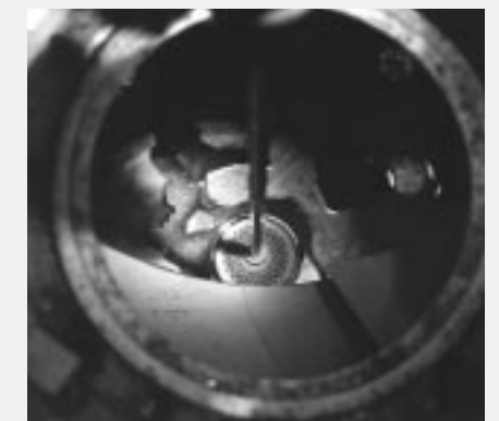
The last bit of extract containing the unstable germanium is drawn out from the gallium tank. The extract appears as a silvery pool floating on top of the duller, liquid gallium metal.

SAGE indirectly measures the solar-neutrino flux by extracting and counting the germanium atoms produced in the gallium tanks. (See Figure 1.) About once a month, a chemical extraction is performed in which individual germanium-71 ( {}^{71}\text{Ge} ) atoms are plucked from among some 5 \times 10^{29} gallium atoms. (Only 1.2 {}^{71}\text{Ge} atoms are predicted to be produced per day in 30 tons of gallium, assuming the neutrino flux predicted by the standard solar model. The efficiency of the chemical extraction is simply incredible.) Just before the extraction, about 700 micrograms of stable germanium is added to the tanks. Monitoring the recovery of this natural germanium allows a measurement of the extraction efficiency for each run. The total germanium extract is purified and synthesized into germane ( \text{GeH}_4 ), a measured quantity of xenon is added, and the mixture is inserted into a small-volume proportional counter.