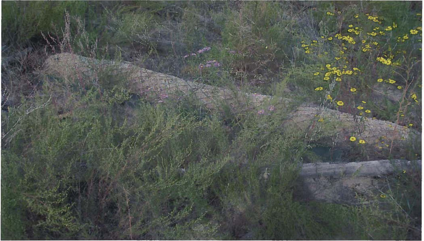
Photo: 42688-10.JPG R00303140012 Berms