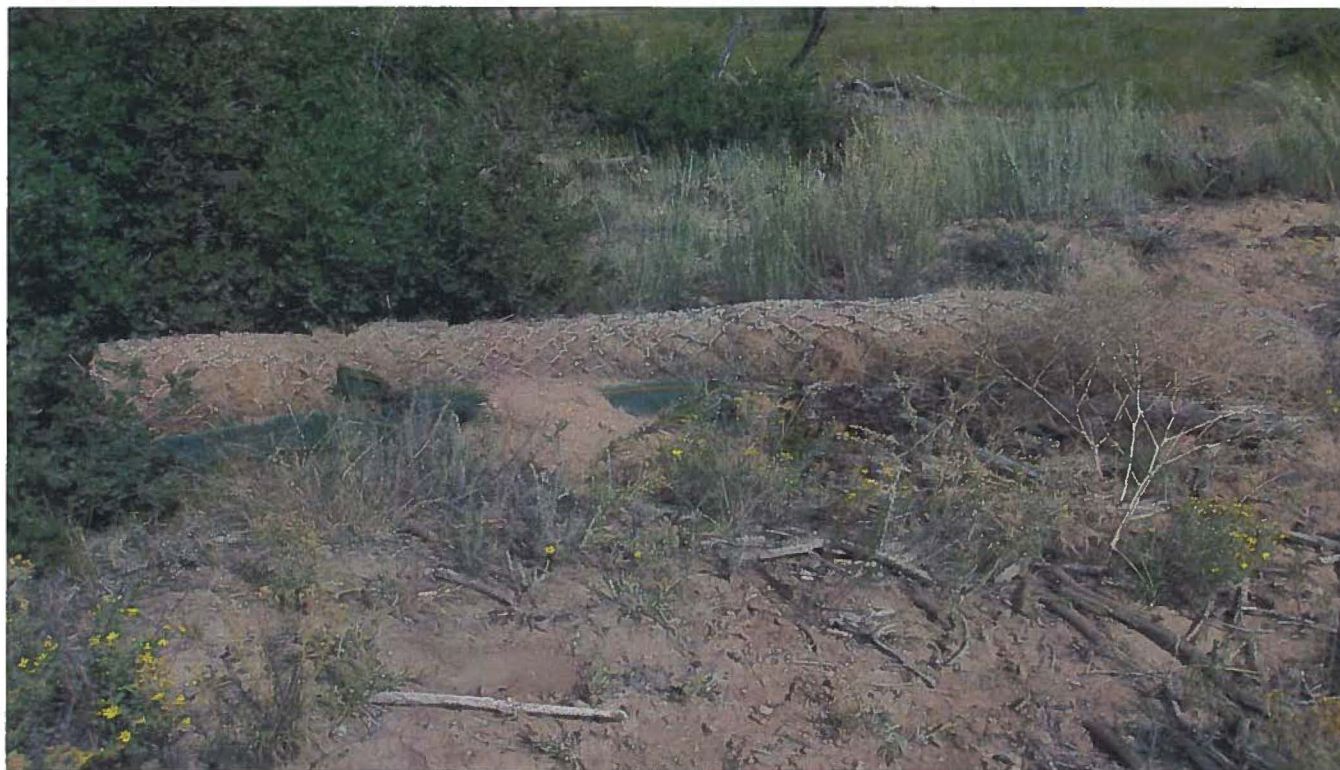
Photo: 42688-14.JPG R00303140015 Berms