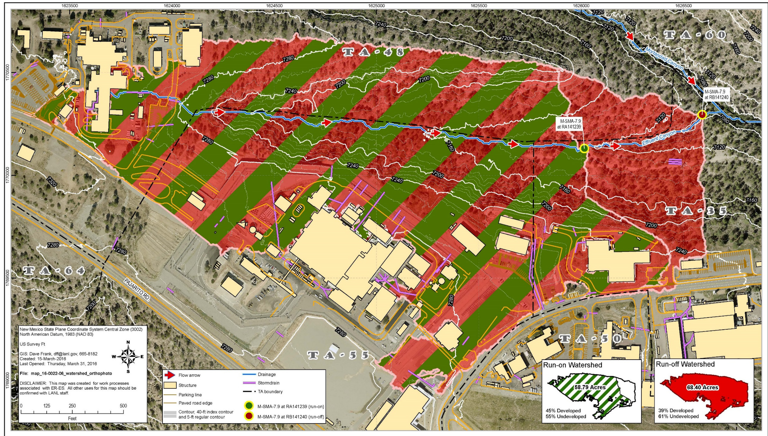
Figure 1 Run-on/runoff SMA drainage for M-SMA-7.9