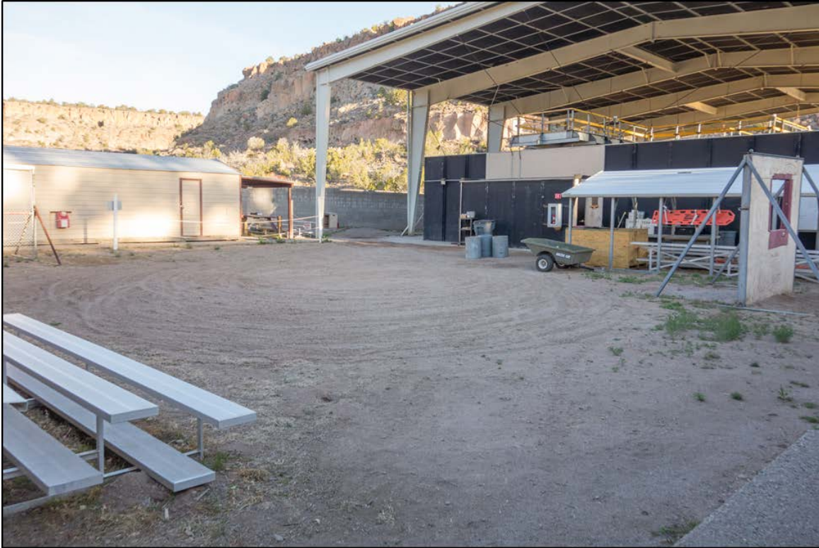
Photograph 1. Proposed location of the new warehouse facing north towards building 36.