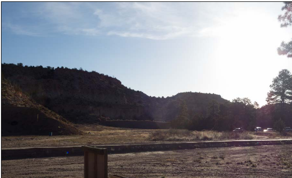
Photograph 2. Looking east toward range 5. The existing dirt roads and the dirt field on range 5 will be covered with asphalt millings or base course.