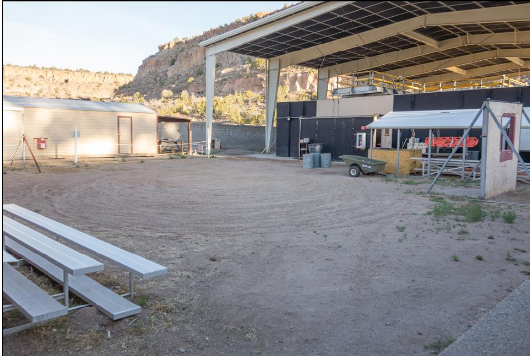
Photograph 1. Proposed location of the new warehouse and sanitary holding tank.