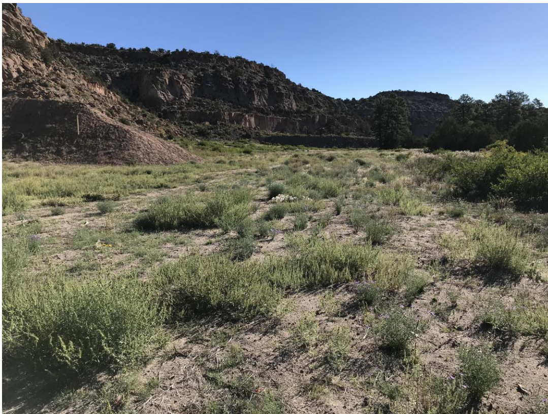
Photograph 2. Looking northeast down Range 5A.