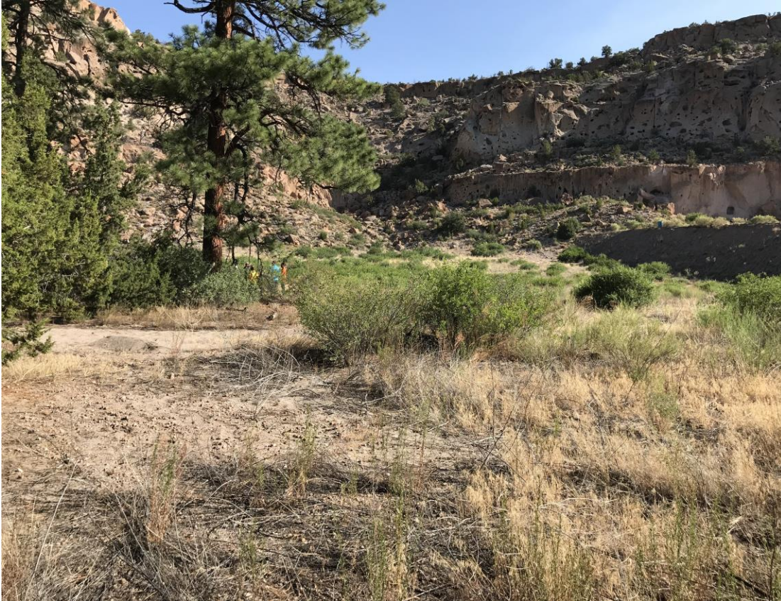
Photograph 3. Looking north down Range 5B.