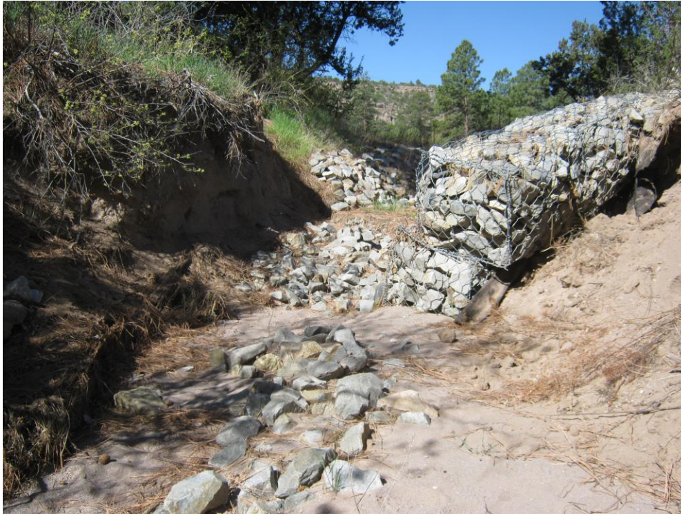
Photograph 4. The channel below dissipation structure will be restructured and the gabion removed.