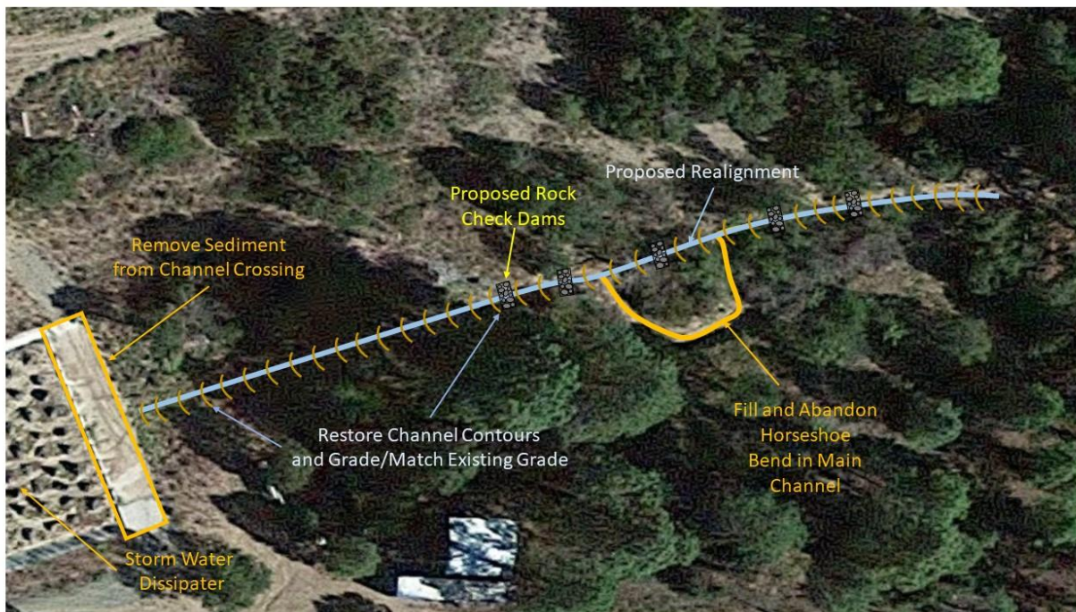
Figure 3. Channel Stabilization Project Map. This project will stabilize the main channel directly downstream of the dissipation structure, straighten the channel and fill in the sharp bend, line the bank and channel bottom with TRM, and install 4-5 rock check dams.