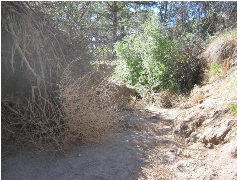
Photograph 5. View of channel degradation and erosion in the sharp bend.